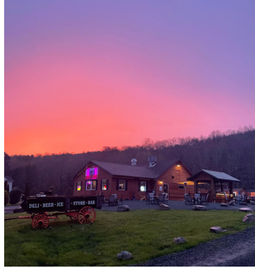
Indoor and outdoor dining and bars