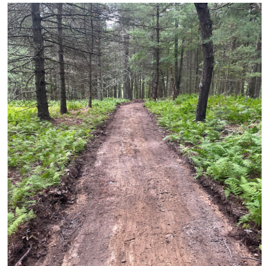
Hiking 2 miles of trails