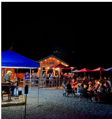
Outdoor Bar and Events